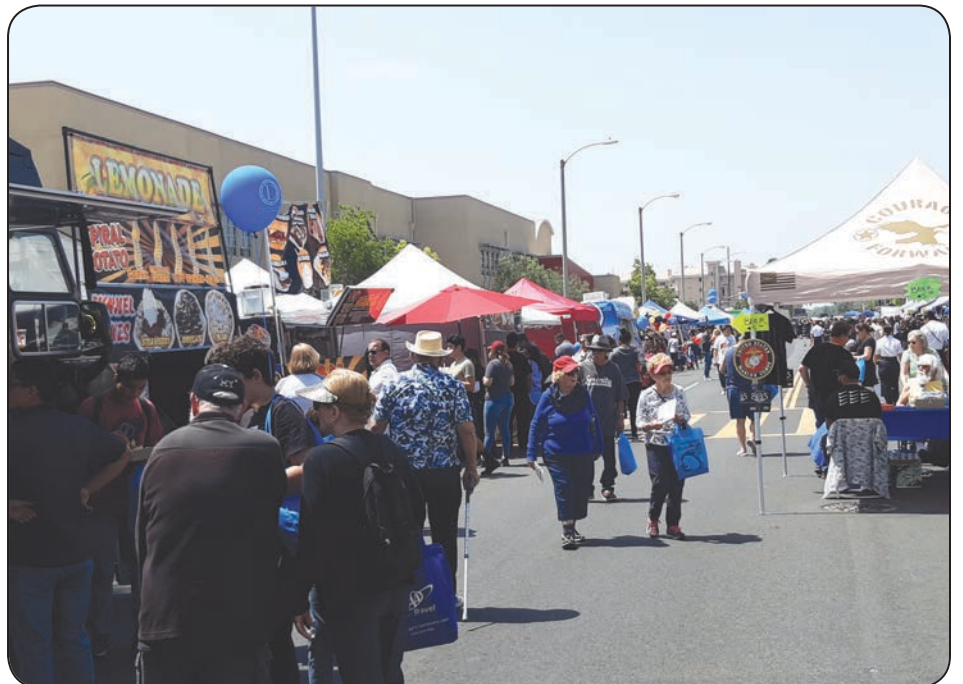
The weather was wonderful, and the crowds were enjoying all the food and Chamber Member Booths