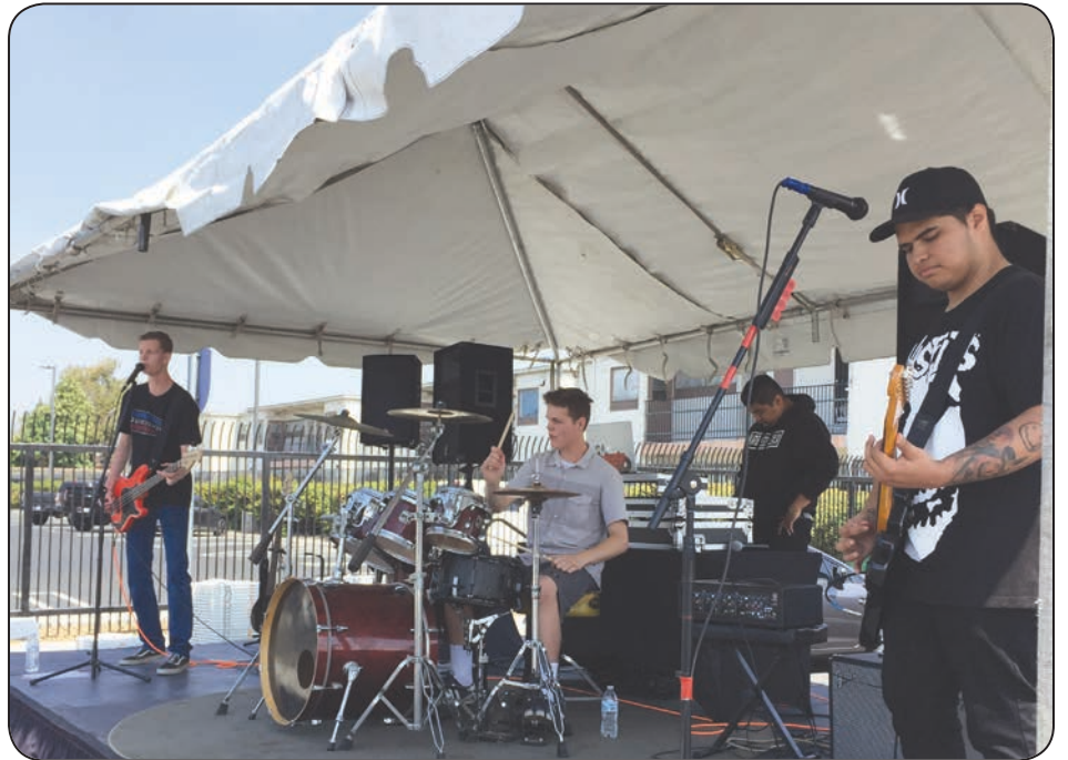
We were lucky to have the popular band "Searching North" playing for the Street Faire crowd.