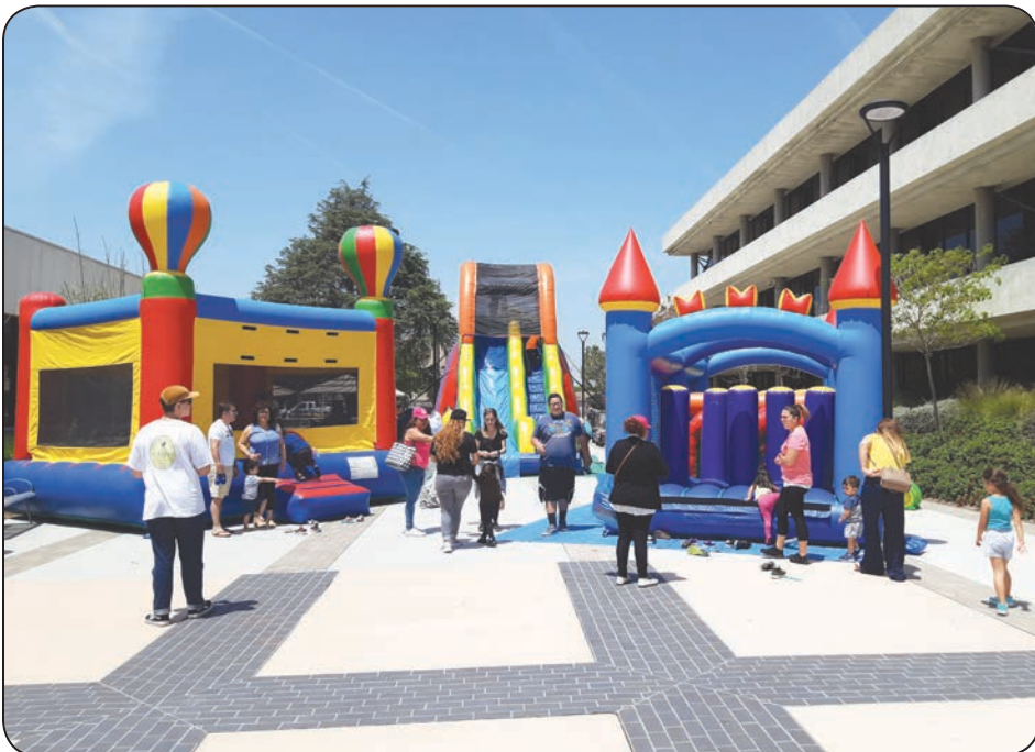
The Kid's Zone was very popular with our Downey Families.