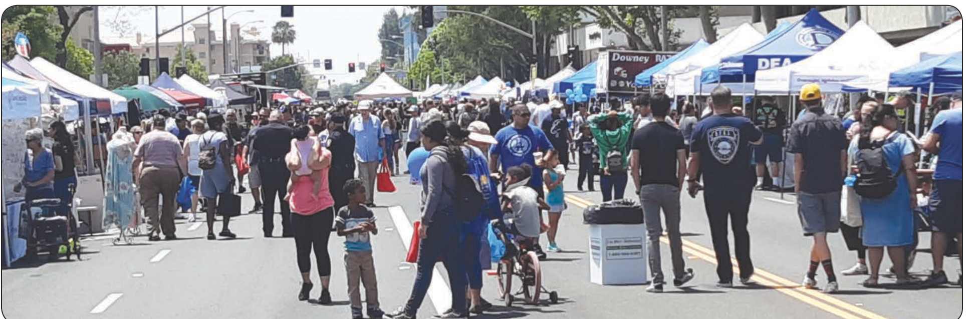
Brookshire Ave was crowded with active Faire goers all having fun!! The Chamber had over 130 booths of information and crafts! Not to mention two stages of entertainment and 12 spots for food and drink.