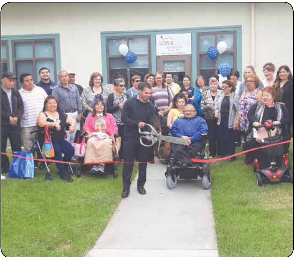
The love and support given to this organization by its clients and staff is so very evident. Everyone wanted to come out and support SCRS-IL as they become our newest Chamber Members. It was difficult to get everyone into the ribbon cutting picture! The Chamber looks forward to having this very valuable organization at upcoming events.